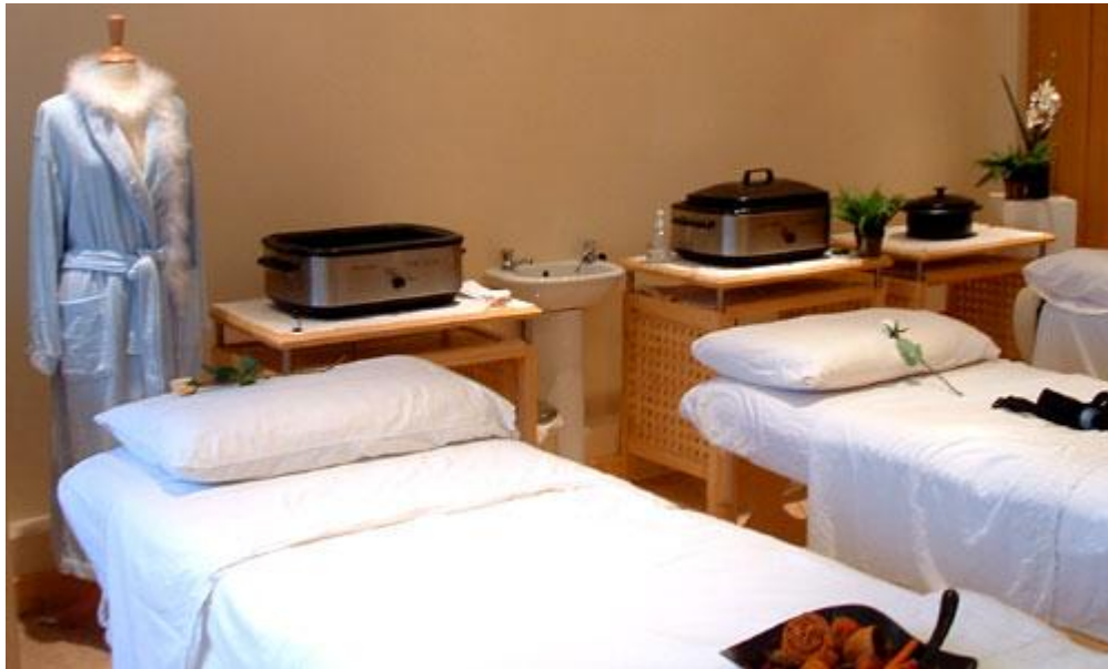
Beauty Training Room at Uisce Day Spa & Education Centre

A minimum of 5 passes in the Junior Certificate or equivalent level of education/life experience. Students must be at least 17 years old at time of course commencement.