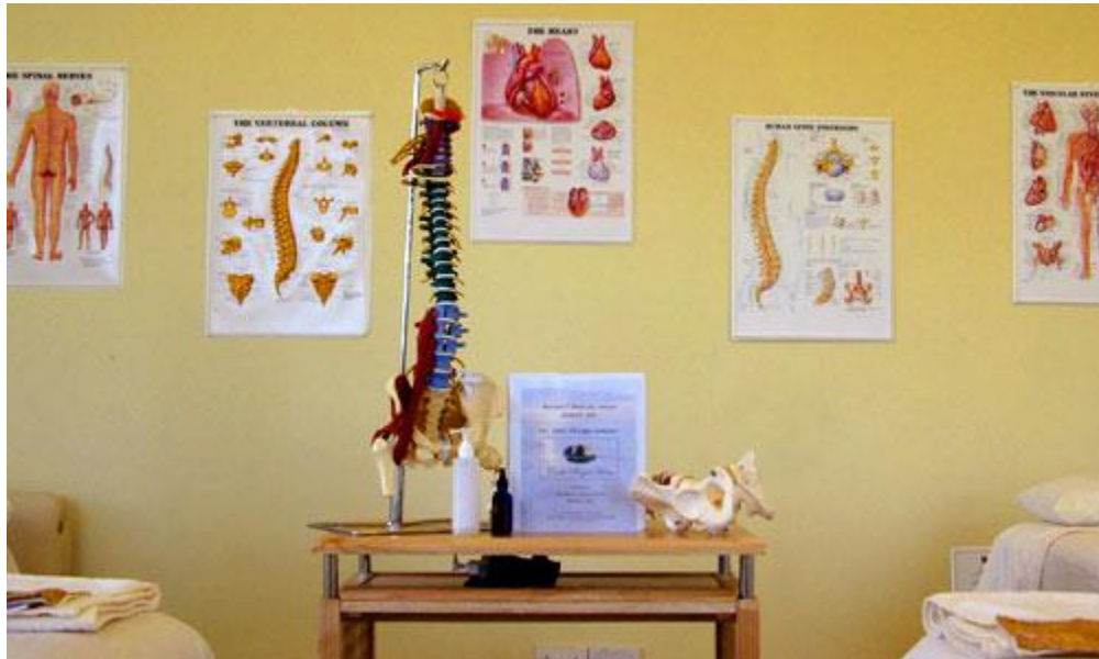
Practical Training at Uisce Day Spa & Education Centre

A minimum of 5 passes in the Junior Certificate or equivalent level of education/life experience. Students must be at least 17 years old at time of course commencement.