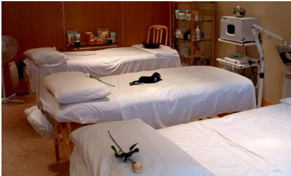
Practical Training Room at Uisce Day Spa & Education Centre

A minimum of 5 passes in the Junior Certificate or equivalent level of education/life experience. Students must be at least 17 years old at time of course commencement.