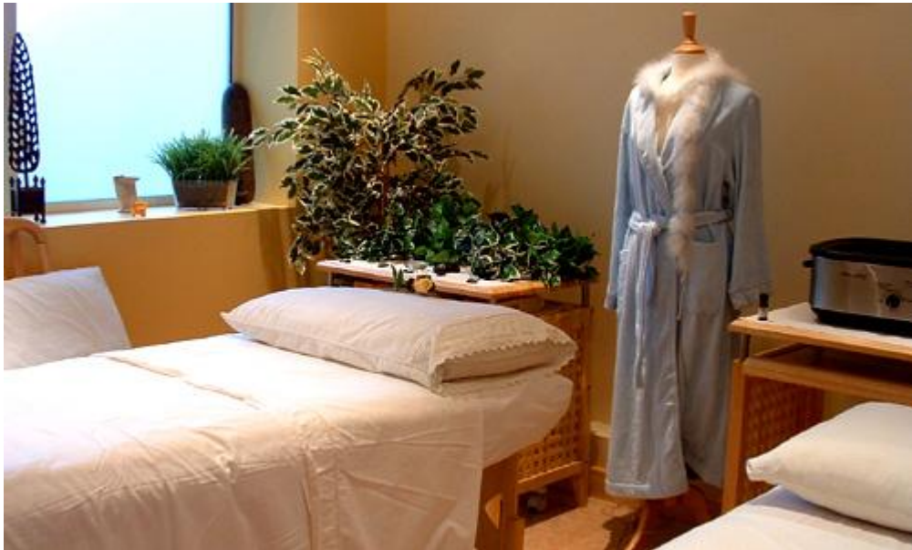
Practical Training at Uisce Day Spa & Education Centre

The Student must hold a Level 3 Diploma in Holistic Massage, or a Level 3 Diploma in Body Treatments, or an ITEC Diploma in a Complementary Therapy or their equivalents.